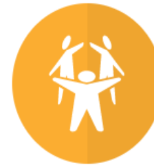
MOBILISATION OF LFCS