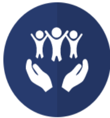
ENDING VIOLENCE AGAINST CHILDREN