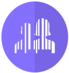
ANTI- TRAFFICKING & MODERN SLAVERY