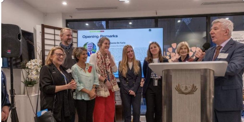
(Figure 1: MFAC Gender Working Group CSW69 High-Level Multi-Faith Reception)

on fostering targeted, collaborative efforts that enhance coordination with UNIATF, reduce duplication across initiatives, and amplify the meaningful contributions of faith actors to the United Nations' work.