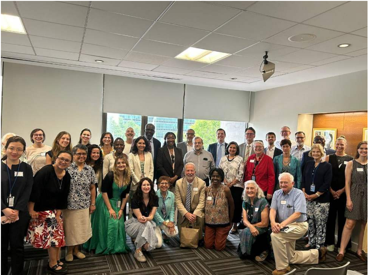
MFAC and UNIATF Members Present at the 2025 Kofi Annan Faith Briefing