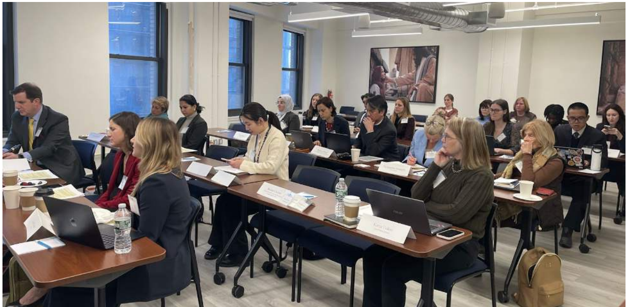
(Figure 4: MFAC Members Present at the 2026 Annual Retreat)