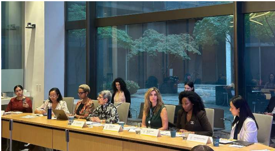
(Figure 6: Panelists During the ‘Side by Side: Connecting Sacred Dialogue and Responses in Promoting Gender Equality and Human Rights’ UNGA Roundtable Hosted by the MFAC Gender Working Group)