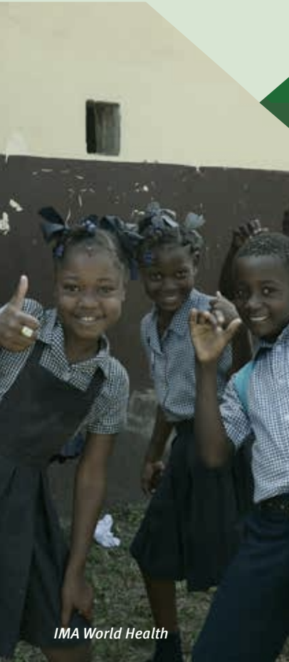
IMA World Health

The Joint Learning Initiative on Faith & Local Communities (JLI) Ending Violence Against Children Learning Hub (EVAC Hub) provides a unique platform for a global network of knowledge from academics, policymakers, and practitioners that are growing the evidence-base of effective faith-based partnerships to prevent and end violence against children.