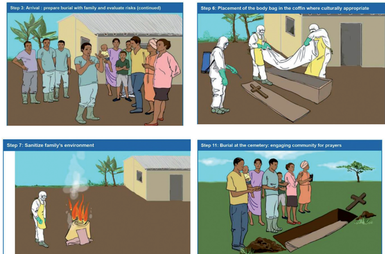
Fig. 1: Selected illustrations from the WHO guideline created for the West African Ebola outbreak. Reprinted from World Health Organization, “How to conduct safe and dignified burial of a patient who has died from suspected or confirmed Ebola or Marburg virus disease – Interim Guidance”. Copyright (2017).

ing practice which could be used to avoid infection without inflicting distress on the relatives, effectively increasing their willingness to cooperate with Ebola control measures.