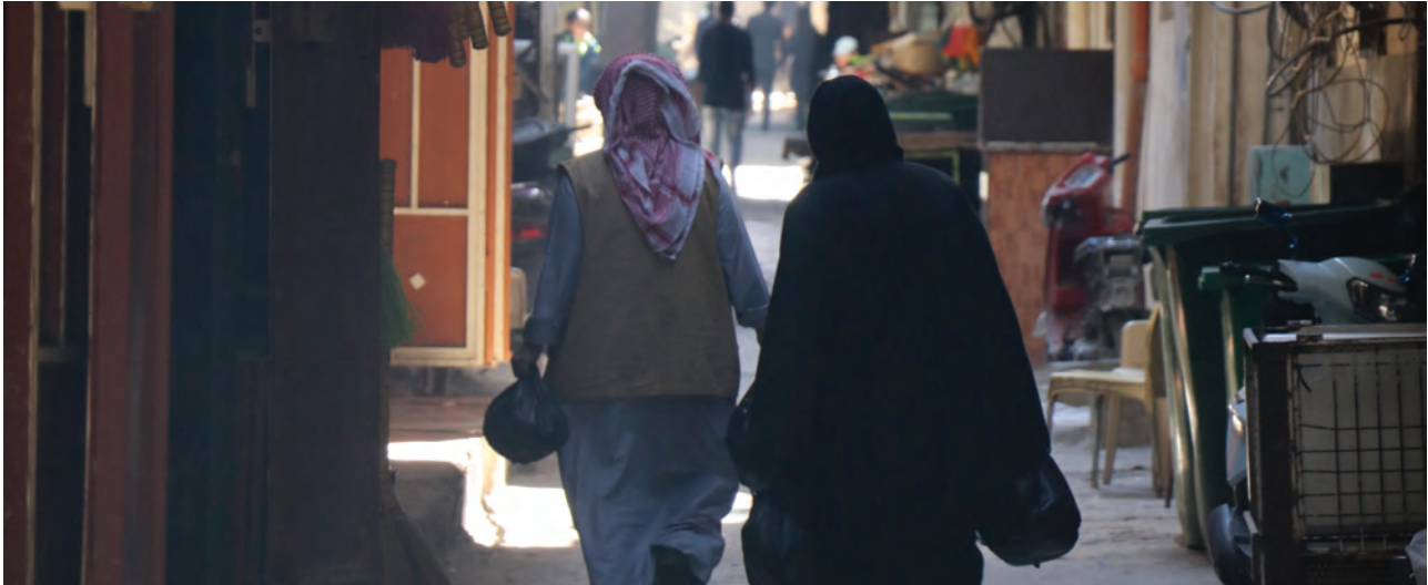
In the streets of Baddawi camp

This final section of the report turns to the complex relationship between religion, social justice and institutionalized responses to refugees through a multiscalar framework, from the local to the international.