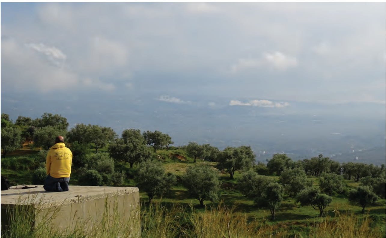
A man prays on the route to Baddawi camp

In conclusion, the multisited framework underpinning our project enabled us to identify the importance of historical and geographical specificities, whilst also highlighting diverse commonalities of experience. These commonalities point to the ways that persecution, violence and diverse forms of social injustice are linked to similar systems and structures of inequality and exploitation. These include states that not only fail to protect refugees and migrants, but also create precarity and risk across time and space. It is against this backdrop that we find non-state actors acting in ways designed to fill the gaps created by states, and seeking to hold states accountable for their responses.