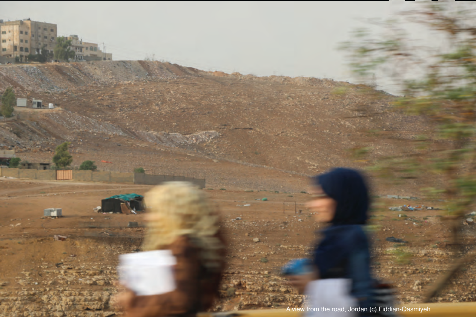
A view from the road, Jordan