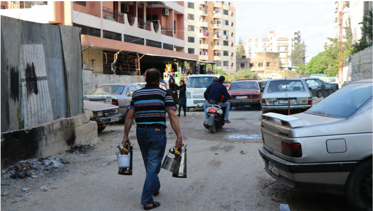
A Syrian coffee vendor on the outskirts of Baddawi camp

the first two sections of the report challenge us to think beyond narratives that interpret faith in contexts of displacement as something to be mistrusted, leading only to negative outcomes, violence or suspicion.