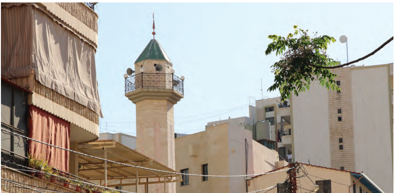
The mosque in Jebel Al-Baddawi, Lebanon

For example, the iconography of both faith-based organizations and US law enforcement groups portray a vivid humanitarian and political emergencies - as migrants cross the border, militaries enforce border security. For FBOs, solidarity lives in images on walls and in shared experiences, such as making and serving food together. For refugees and migrants, it is expressed in a shared history, through the actions of people and what is left behind: a sense of suffering and sacrifice. In contrast, law enforcement agents exhibit a different form of solidarity – one rooted in patriotism, service, and professionalism. 92 We can contrast here a religious, sacred sense of solidarity with a secular, nationalistic language of solidarity, both highlighting the need to stand together and be ready for collective action.