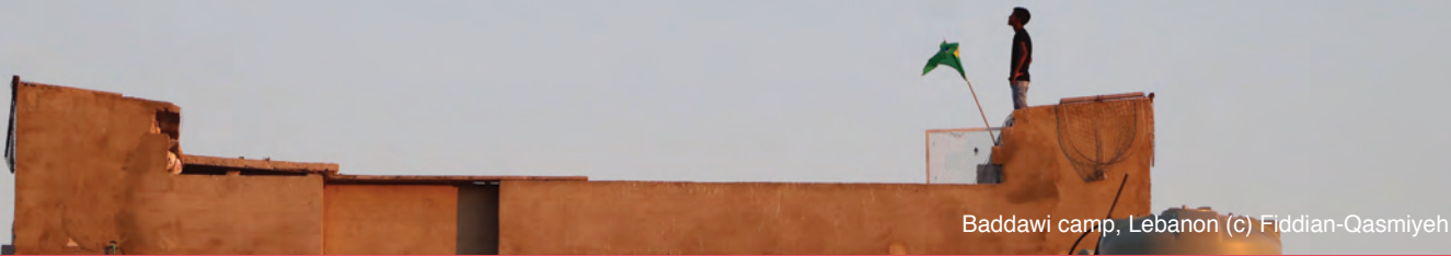
Baddawi camp, Lebanon