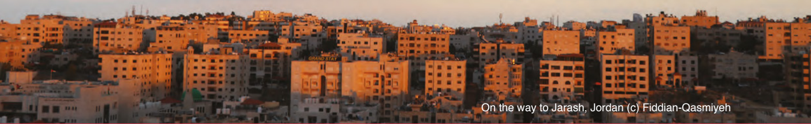
On the way to Jarash, Jordan