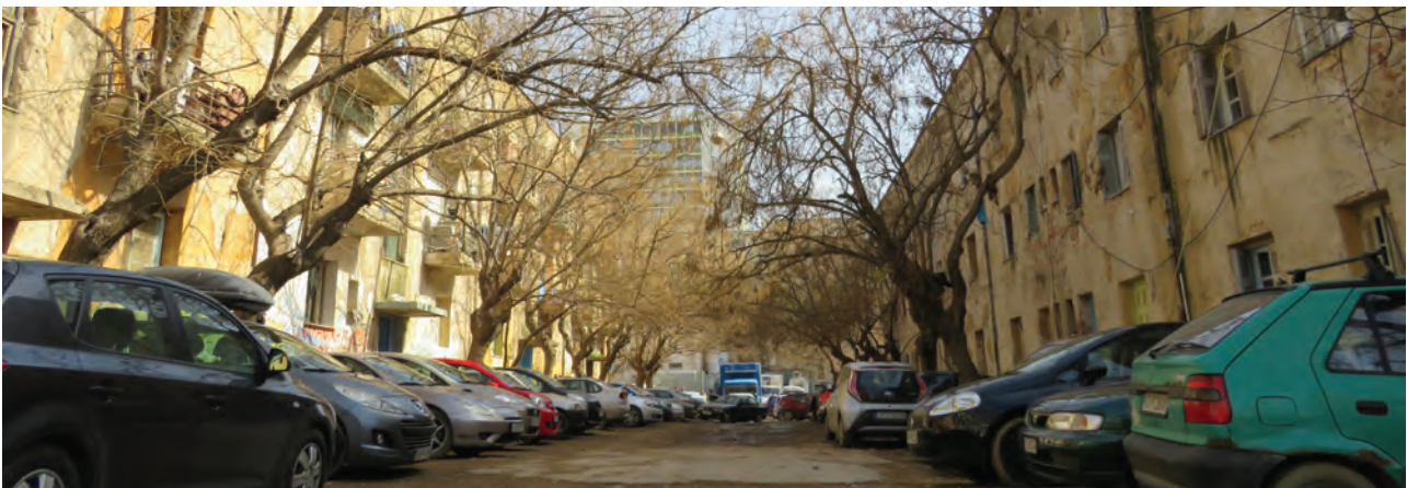
Refugee housing project from 1900s, Athens

It seeks to do so whilst recognizing the extent to which states around the world are increasingly introducing restrictions and political strategies that currently prevent many of these principles from being put into action. These restrictions and strategies range from travel bans and deportation regimes, to journalists and humanitarian workers being killed, to humanitarians and solidarians being criminalised, to the introduction of finance laws and countering violent extremism policies, all of which are having, and will continue to have, wide-ranging effects. 100