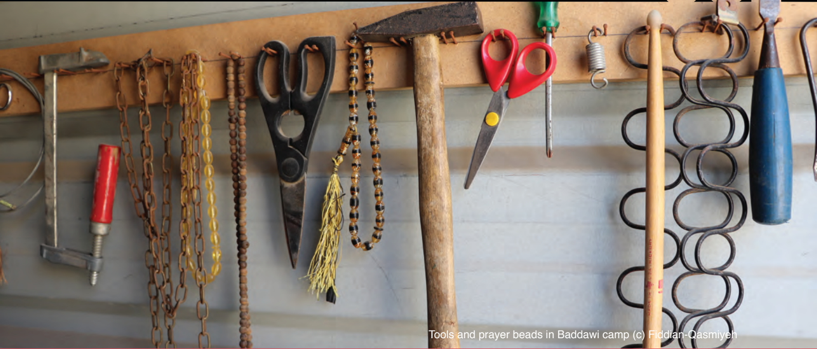
Tools and prayer beads in Baddawi camp