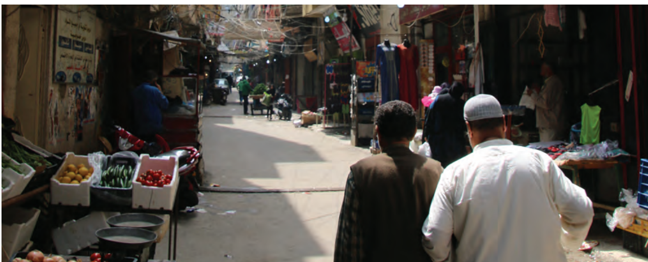
An evening stroll in Baddawi camp, Lebanon

Acknowledging, and appreciating the “significant work” undertaken by refugees and refugee-hosts must take place in conjunction with the acknowledgement of the responsibilities and duties that should be upheld by international actors, including states, UN agencies and INGOs.