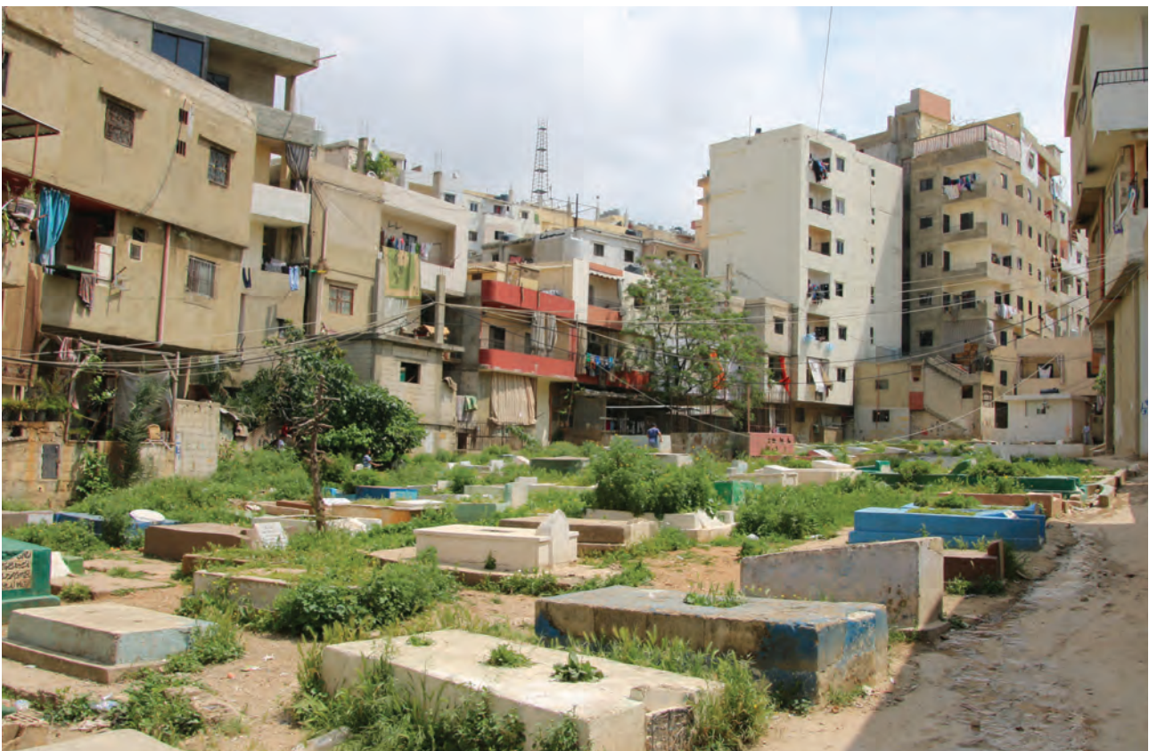
The original cemetery in Baddawi refugee camp, Lebanon

As such, this report examines the significance of religion and politics in relation to social justice for refugees and the racialization and politicization of refugees and refugee response.