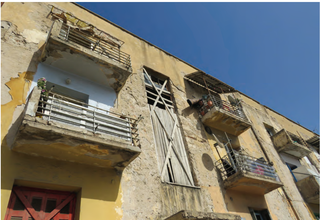
Refugee housing project from the 1920s in Ambelokopi, Athens

In this instance, as in the case of Lebanon explored below, 44 religious rights are conceived of not merely in terms of accommodating the living: the right to be buried as a Muslim is imagined as a refugee right which must be fought for. Refugees in Greece regularly described how their faith and their religious practice was a source of strength as they endured extreme stress. Providers also talked about the ways that religious community and ritual was often a source of support and comfort for refugees. Importantly, as this example, and many others from the research in Lebanon, Cameroon, Jordan and Mexico also indicate, the people who 'provide for' refugees 45 are often themselves either refugees or the descendants of earlier generations of migrants or refugees.