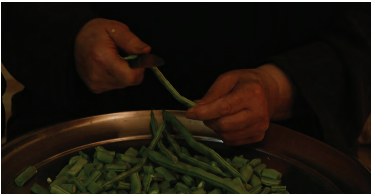
Preparing food in Baddawi camp

Indeed, a key factor emerging in such assumptions is precisely the extent to which Muslimness or religiosity is overexaggerated by external observers and becomes the overarching frame of reference, erasing recognition of not only the potential for, but reality of, solidarity across political lines.