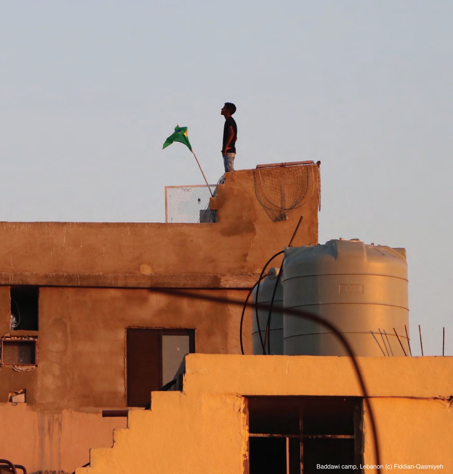
Baddawi camp, Lebanon