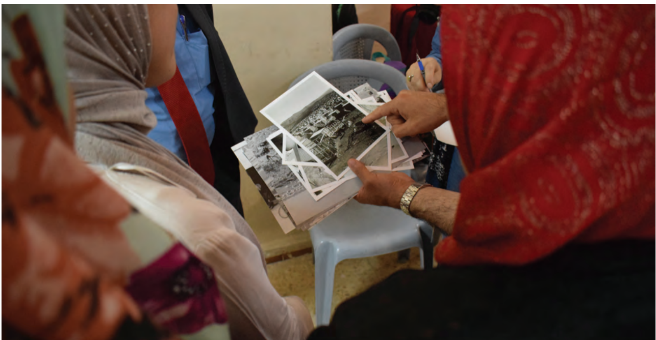
Participants attending a Refugee Hosts writing workshop, Jordan

on their nationality. On the one hand, Palestinians from Syria only receive limited assistance from UNRWA and can only access UNRWA-run educational and health services which are increasingly under-funded and under strain. 62 On the other hand, non-Palestinian refugees from Syria (including Syrians, Iraqis, Kurds) are registered with UNHCR and are entitled to a wider range of services and programmes. Most importantly for many residents in the camp, non-Palestinian refugees from Syria have the possibility of being referred by UNHCR to be resettled to a third country. Palestinian refugee families who have resided in the camp since the 1950s remain stuck in the camp, observing the different forms of assistance and possible resettlement options that are being provided to new arrivals. 63