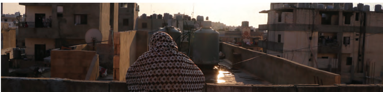
Looking out over Baddawi refugee camp, Lebanon

A theme arising throughout the report pertains to the centrality that is, can and should (or should not) be given to religion in processes of displacement. Greater attention must be given to the varying ways in which religion is imposed, adopted, rejected, and negotiated as a key marker of identity by different stakeholders affected by and responding to displacement, including members of refugee, host and refugee-host communities.