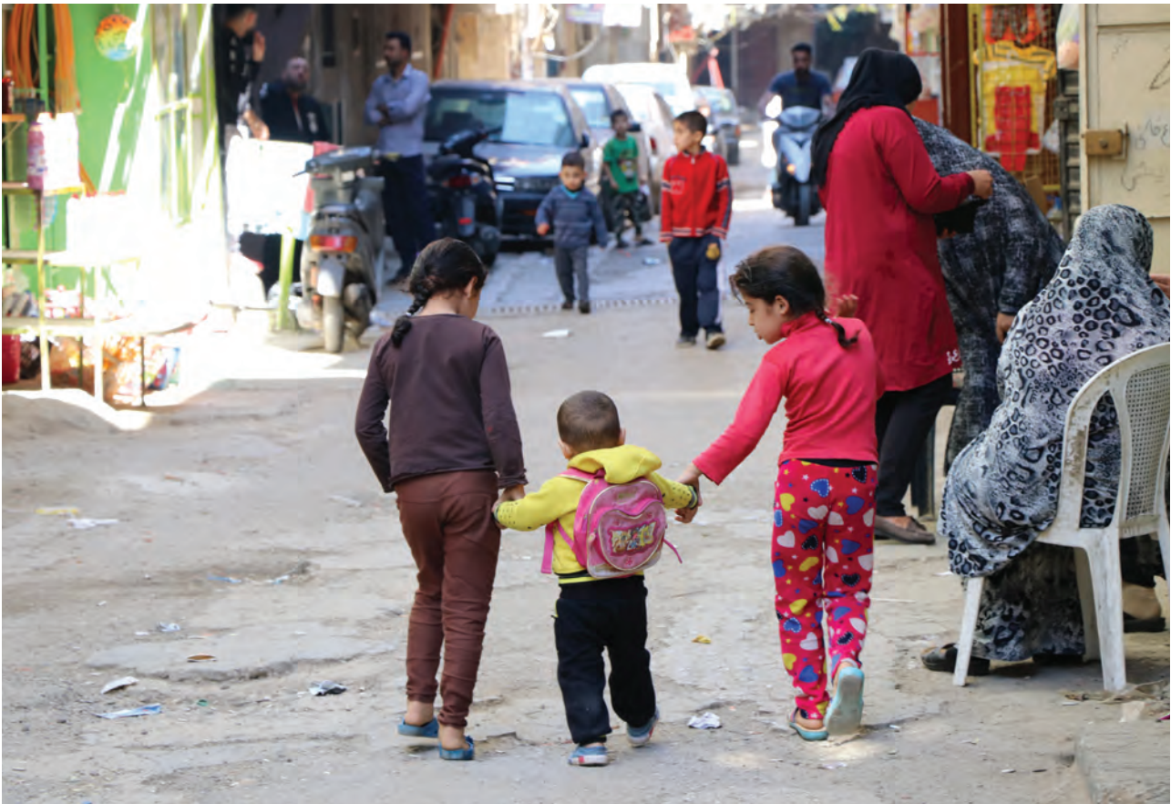
On the way to school, Baddawi refugee camp, Lebanon