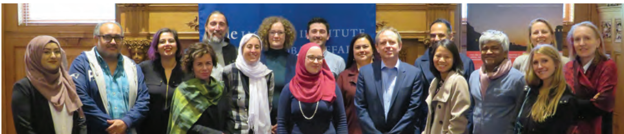
The research team and colleagues at the Bridging Voices Workshop, Yale, May 2019

The research teams experienced several challenges in the course of fieldwork which are important to acknowledge and reflect upon.