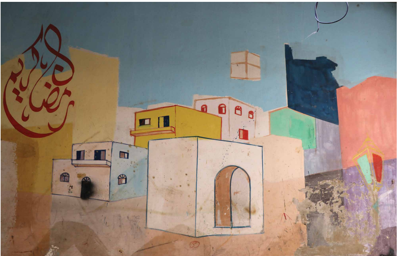
A mural in Baddawi camp wishing passersby a Ramadam Kareem

The report concludes with a synthesis of the key implications of this study for research. This lays the foundations for a 2020 Policy Briefing which will draw out the policy relevance of the research.