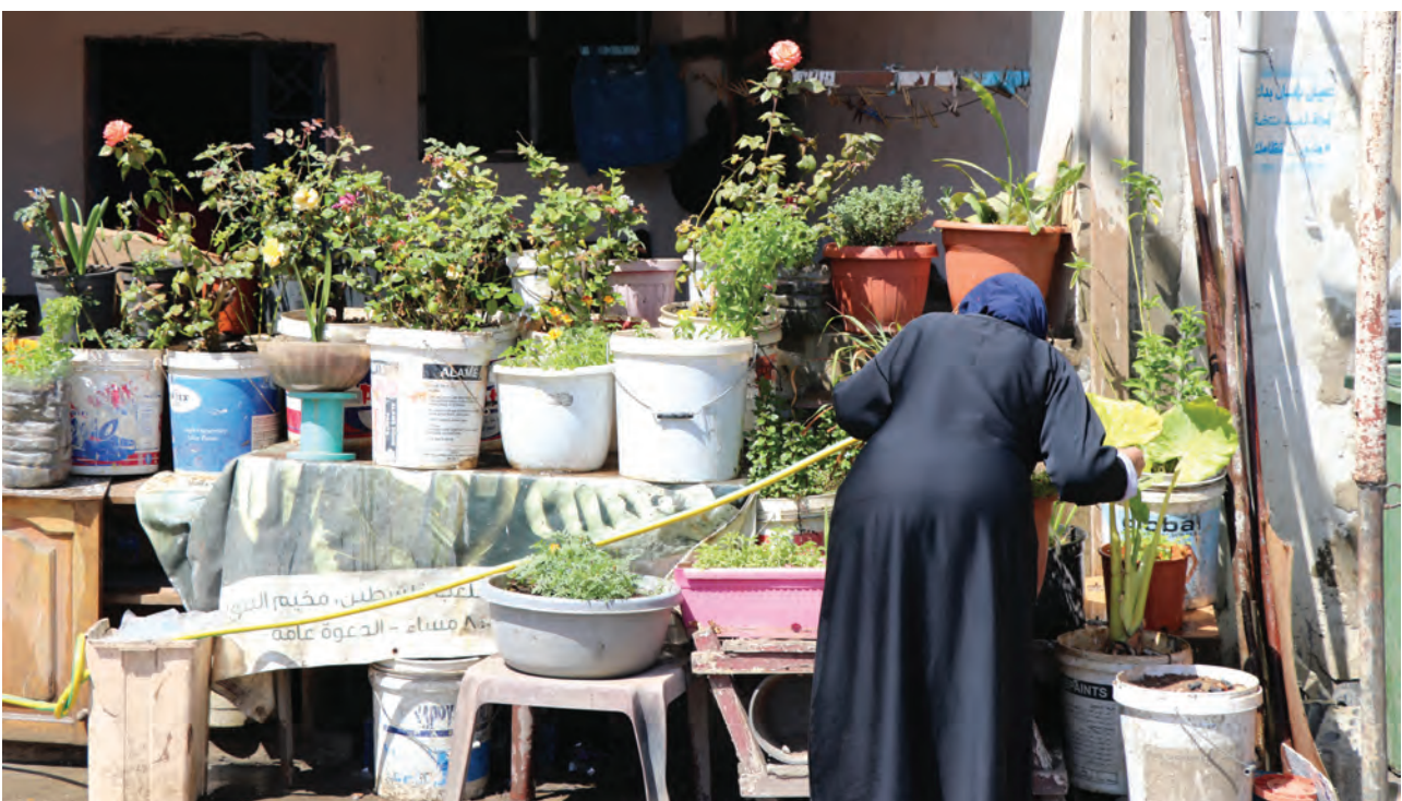
A woman waters flowers in Baddawi refugee camp, North Lebanon

Like many members of host communities and faith-based organisations, refugees themselves act to support members of their own and other communities precisely because states and international organisations are failing and refusing to do so. The invocation of depending on God emerges precisely as a direct critique of the failure of political systems. 102 Far from a fatalistic response to such conditions of manufactured precarity and restrictionism, local and transnational actors alike are creating diverse ways of conceiving