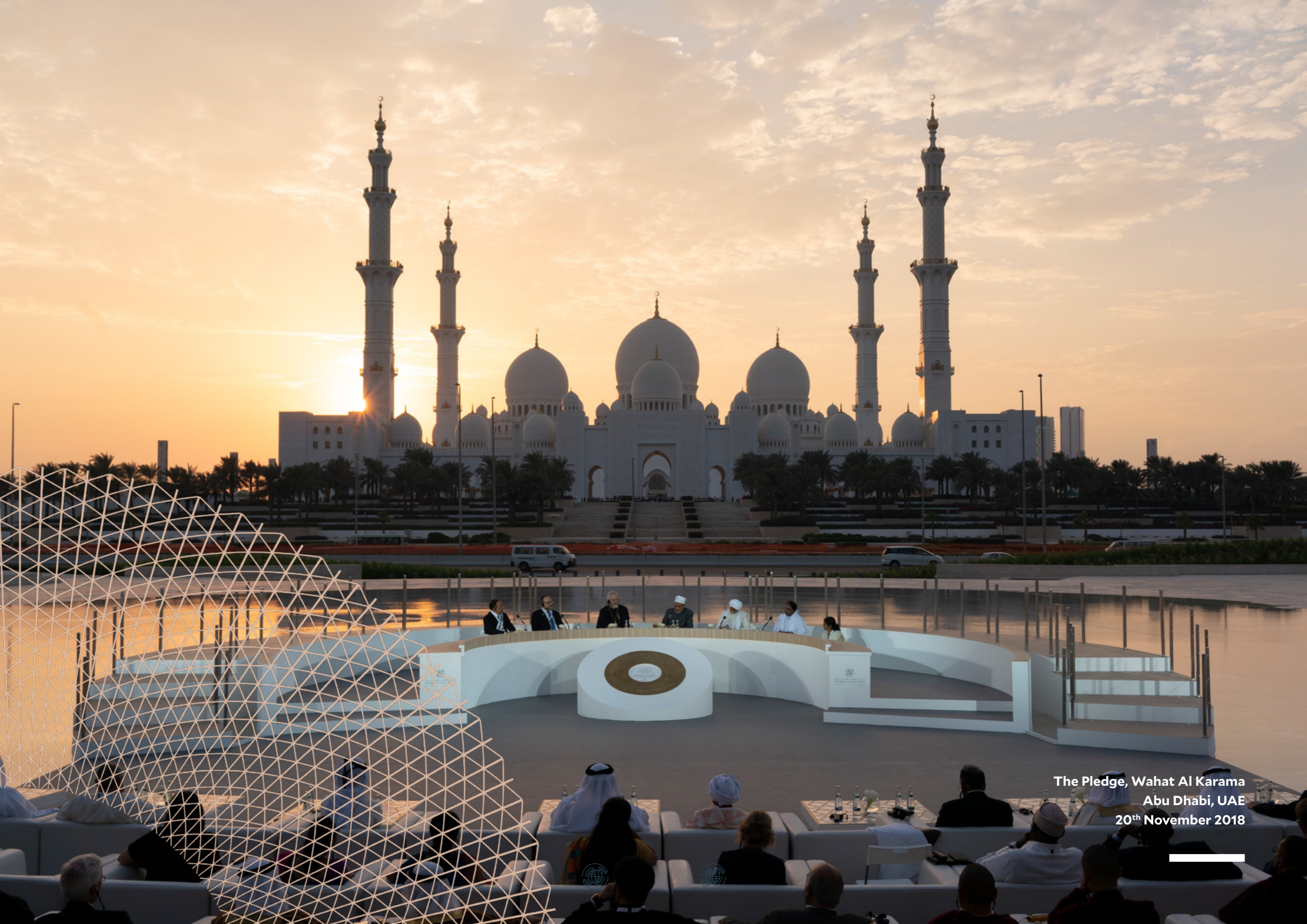
The Pledge, Wahat Al Karama Abu Dhabi, UAE 20 th November 2018