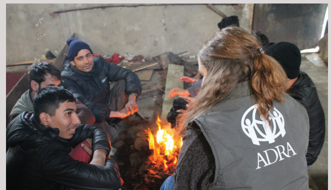
ADRA works with Syrian refugees in Serbia.