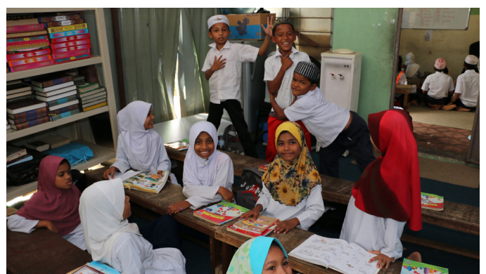
Volunteers, ICAN Malaysia