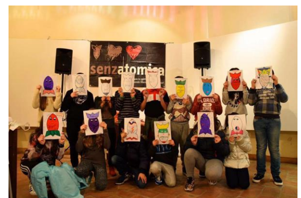
Youth participate in an activity in Italy's Senzatomica campaign

component, the ongoing campaign also organizes events such as conferences, flash mobs, book readings, concerts and film screenings. Since 2011, the exhibition has been viewed by more than 320,000 people.