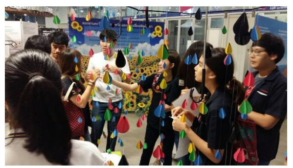
Thai youth organize a showing of the "Everything You Treasure" exhibition in Bangkok (2016)

In Thailand, the student-organized Young Plants of Peace aims to foster global citizens who can understand others, build trust and harmony in society, and cultivate a culture of peace in Thailand and the Southeast Asian region. Through this initiative, youth members of SGI