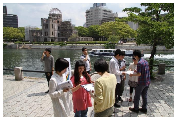
Youth in Hiroshima, Japan conduct a peace awareness survey (2013)

Despite the internationally shared understanding that nuclear weapons are inhumane and thus should never be used, they continue to be framed as a key part of international security and, ironically, peace.<sup>1</sup> Many view nuclear weapons as a necessary evil,