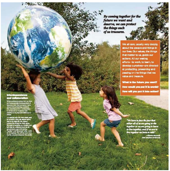
A panel from the exhibition, "Everything You Treasure – For a World Free from Nuclear Weapons"

Launched in 2007, the aim of the "People's Decade for Nuclear Abolition" campaign is to increase the number of people who reject nuclear weapons at the grassroots level.<sup>7</sup> While discussions surrounding nuclear disarmament can appear to be far removed from daily realities or be left to experts and political leaders, the People's Decade recognizes the role of citizens in creating a groundswell of demand for nuclear abolition that will influence decision-makers. The project was derived from the 2006 proposal<sup>8</sup> made by the SGI