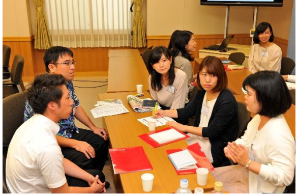
Youth in Japan engage in conversation about nuclear weapons (2017)

Two international surveys on youth awareness on nuclear weapons were conducted as part of the People' Decade in 2010 and 2013, with responses from thousands of youth in 8 and 9 countries, respectively.<sup>11</sup> In the 2010 survey, 86.4% of the participants were aware that atomic bombs had been used in World War II, with Japan having the highest degree of awareness at