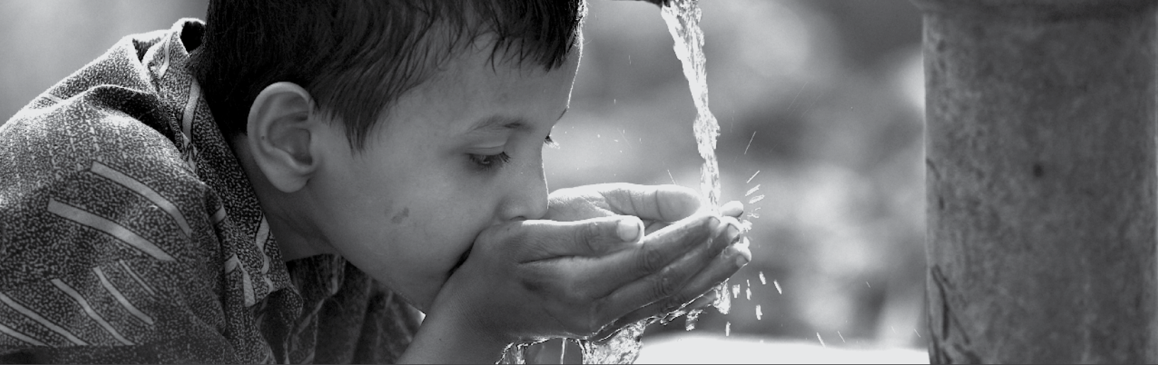
A boy drinks water from a hand pump (Bangladesh).