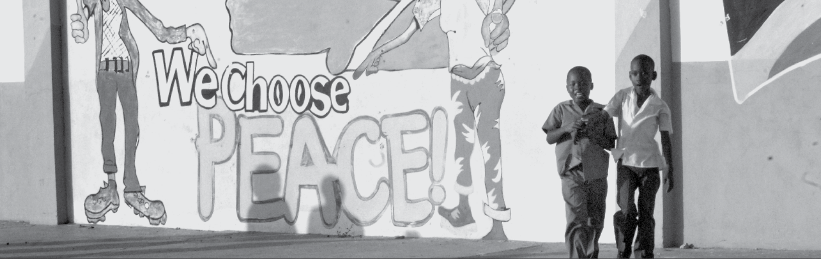
Boys walk near a mural promoting peace at a centre that provides young people in violence-affected communities with a safe space for recreational activities and training in life-skills and conflict-resolution (Jamaica).