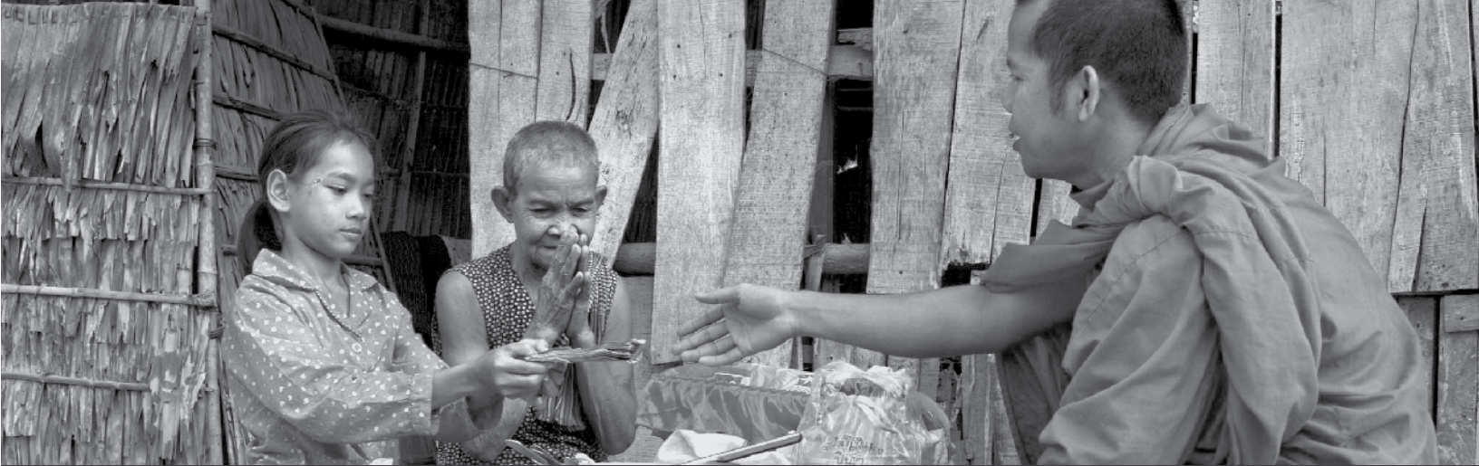
As part of a Buddhist leadership Initiative supported by UNICEF, a monk visits a woman caring for her orphaned granddaughter (Cambodia).