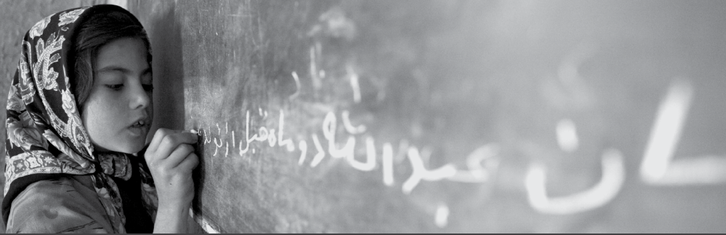
A girl writes on the blackboard inside a mosque that serves as an informal community-based school to which UNICEF provides teacher training, textbooks and other supplies (Afghanistan).