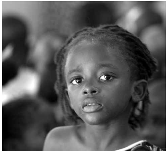
A girl joins other children for a meal and activities at a centre for vulnerable children run by Catholic nuns (Central African Republic).