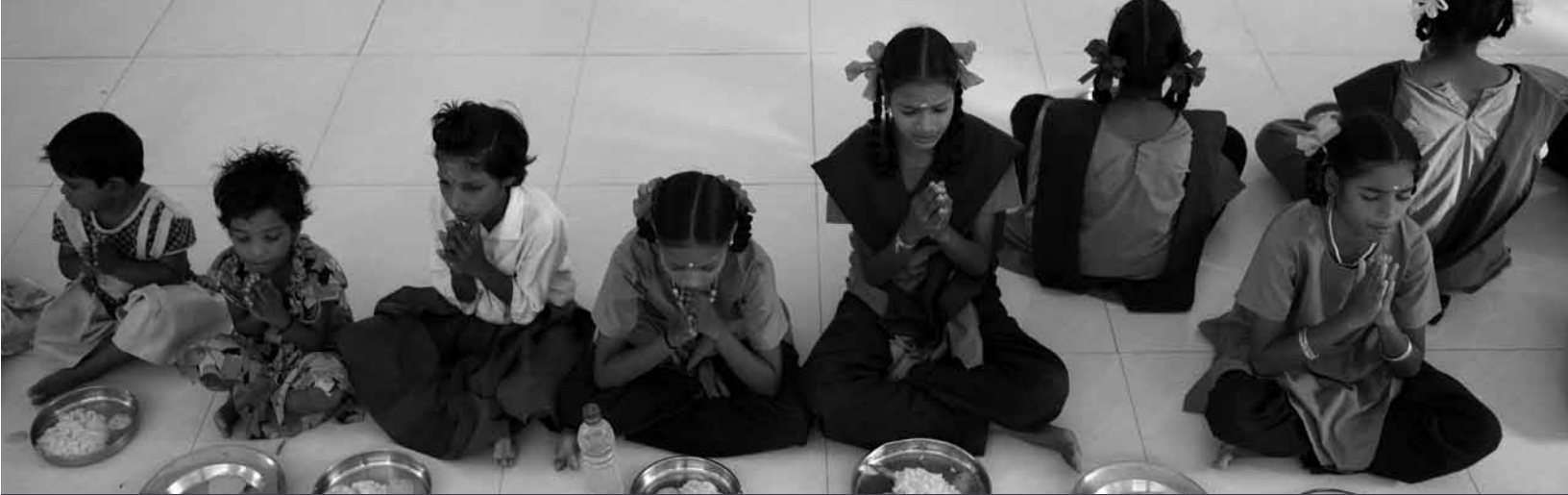
Girls pray before breakfast at the Government Home for Tsunami-Affected Children, which provides care, shelter, basic education and recreational activities for orphans and other vulnerable children, most of whom are from fishing villages (India).