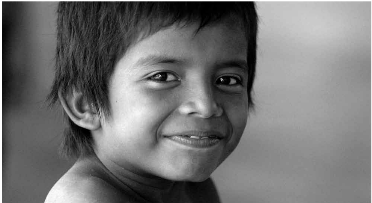
An eight-year-old indigenous boy from an area where UNICEF supports the training of teachers and community leaders to promote traditional languages and customs (Venezuela).

and intercultural education to culturally sensitive health services, birth registration and ending the violence, abuse and exploitation suffered by indigenous children. For example, the UNICEF Regional Office for Latin America and the Caribbean has been working consistently since 2004 with a programme on the rights of indigenous children in 17 country offices to generate strategic information, empower indigenous peoples (primarily women and adolescents) and build the capacity of counterparts (mainly governments) and UNICEF staff.