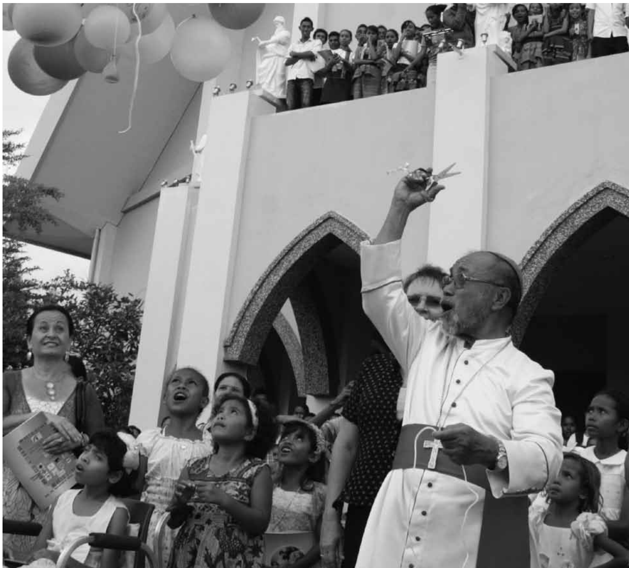
As part of the Day of Prayer and Action for Children initiative, which aims to mobilize religious communities to promote children's rights, the Bishop of Dili along with children and special guests gather in front of the cathedral to release balloons signifying hope for a better protective environment for children (Timor-Leste).