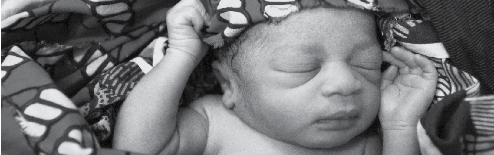
A newborn baby sleeps in the Princess Christian Maternity Hospital (Sierra Leone).