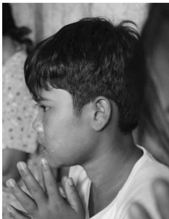
A boy whose parents are migrant workers from Myanmar attends a religious ceremony to remember fellow citizens who died in a tsunami (Thailand).

The profound influence that spirituality and religion can have on children’s development and socialization offers the potential to reinforce protective influences and promote resilience. The beliefs, practices, social networks and resources of religion can strengthen children by instilling hope, by giving meaning to difficult experiences and by providing emotional, physical and spiritual support. When child rights efforts are grounded in the protective aspects of religious beliefs and practices and a community that encourages and enriches the spiritual and religious life of each child, the impact can be far-reaching and sustained.