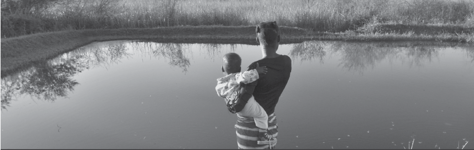
A woman holding her HIV-positive nephew, for whom she is caring after his mother died of AIDS (Zambia).