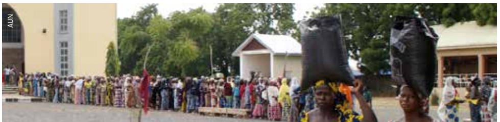
IDPs queuing for food, Yola, Nigeria.

Throughout the crisis, AUN collected data on the IDPs – where they were from, age, gender, level of schooling and so forth. When we offered to turn this data over to a major international organisation, their