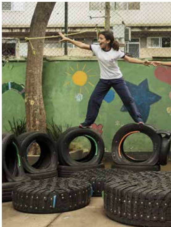
A 12-year-old Syrian refugee girl plays with her new Brazilian friends at school in Sao Paulo, Brazil.

The visas were thus a way to facilitate the arrival of Haitians in Brazil, an innovative measure for making it easier to reach a safer country. But once in the country they did not have guaranteed migration status. In light