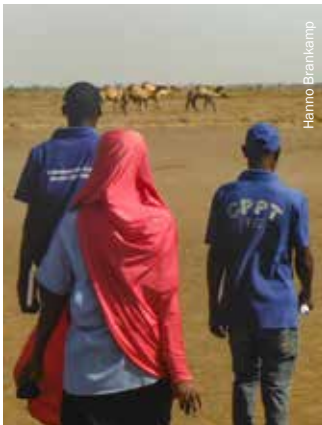
CPPTs on patrol in Kakuma refugee camp.