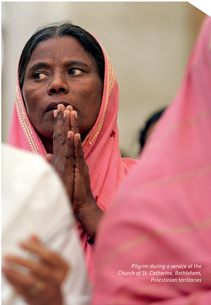
Pilgrim during a service at the Church of St. Catherine, Bethlehem, Palestinian territories