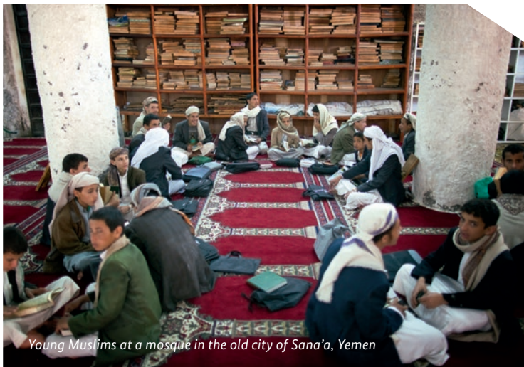
Young Muslims at a mosque in the old city of Sana'a, Yemen