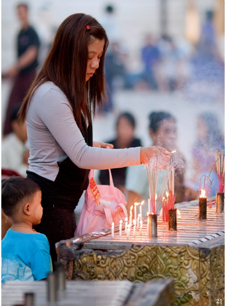
Worshipper at Shwedagon Pagoda in Yangon, Myanmar