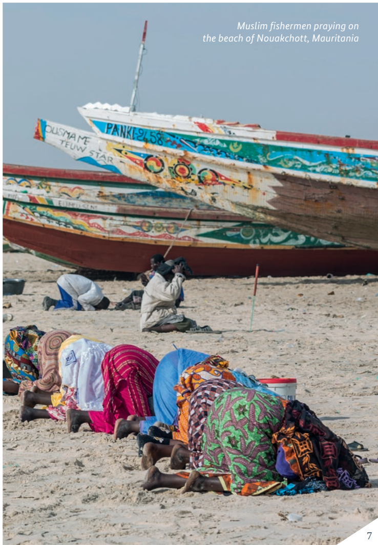
Muslim fishermen praying on the beach of Nouakchott, Mauritania