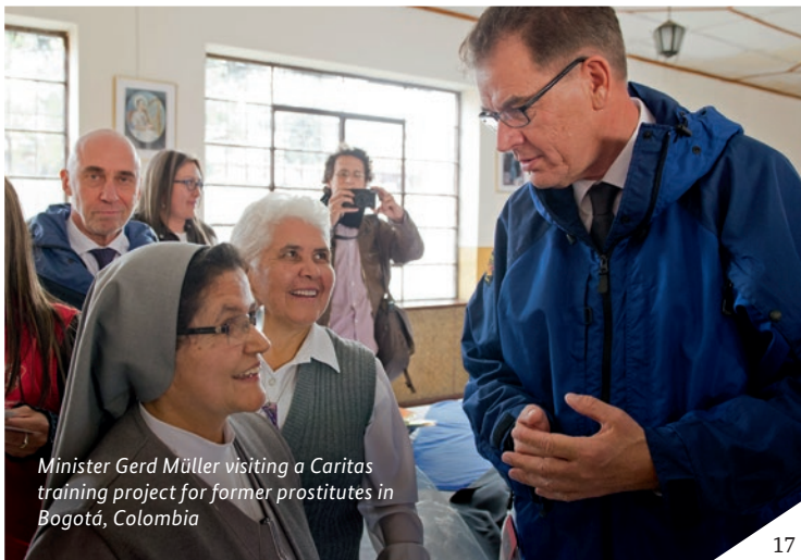
Minister Gerd Müller visiting a Caritas training project for former prostitutes in Bogotá, Colombia