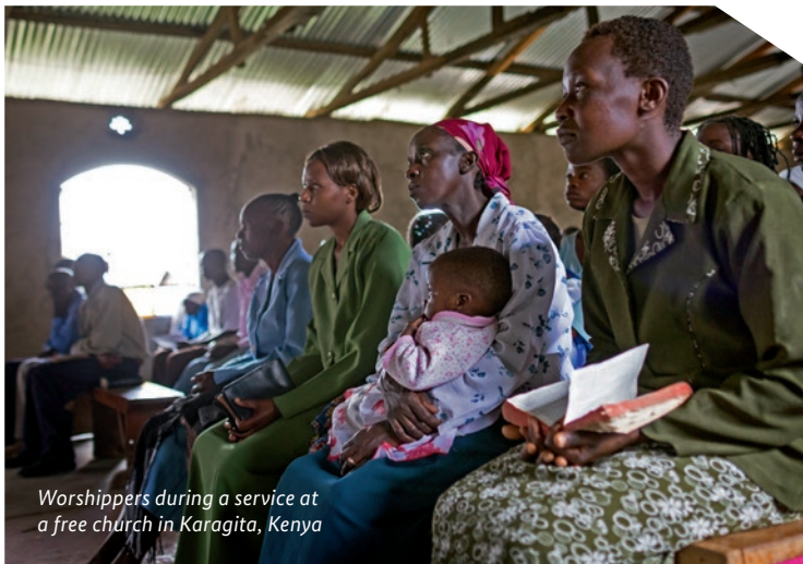
Worshippers during a service at a free church in Karagita, Kenya