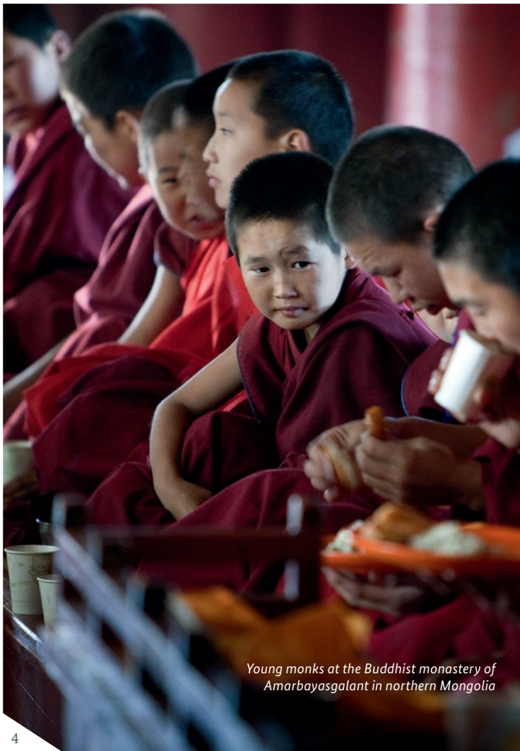
Young monks at the Buddhist monastery of Amarbayasgalant in northern Mongolia