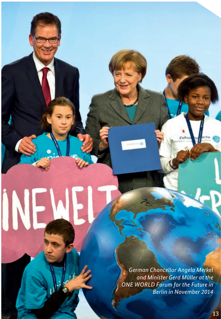
German Chancellor Angela Merkel and Minister Gerd Müller at the ONE WORLD Forum for the Future in Berlin in November 2014