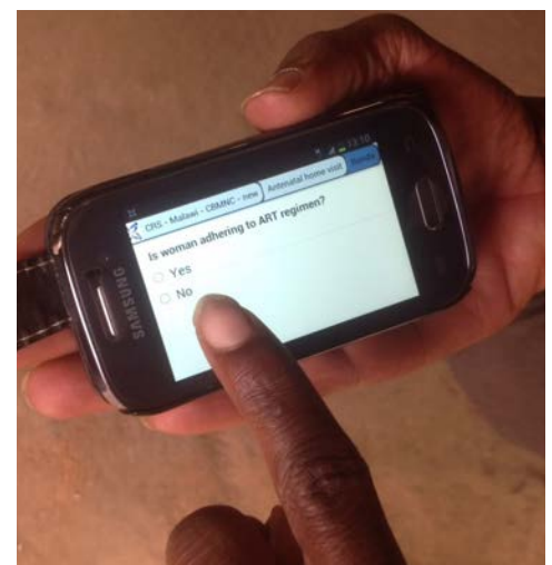
Step-by-step guidance makes the complex MIP protocol easier to follow.

Once the application was finalized, IMPACT supported the training of 256 HSAs serving the hardest to reach communities across the IMPACT program's nine districts. The