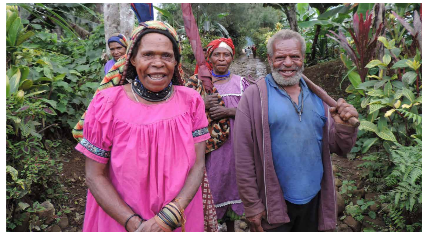
Photo above: Elders walking through their village in Tari, Hela Province

It is hoped that the new financial year will bring with it new and creative ideas that will help enhance the coordination on Gender activities among the Church partners.