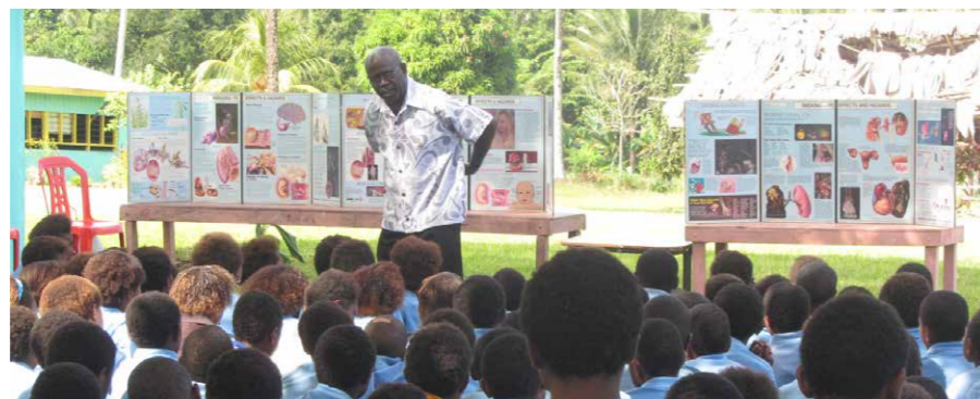
Photo above: Cessation Program at Miak Primary School, East Sepik Province

As a church, 130 church leaders in the three local missions are integrating the smoking cessation program with their evangelistic program in their communities. The SDA Church through its local mission health department has provided mentoring and routine health check-up services to more than 800 chronic smokers who seek support to break the habit of smoking in Madang (Madang/Manus Mission).