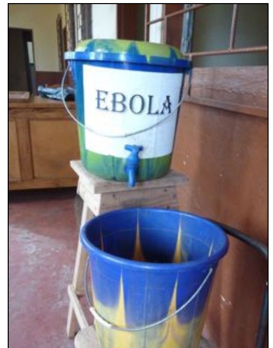
Freetown, top left. Road block restricting traffic, lower left. Typical hand-washing station outside an office building – right.