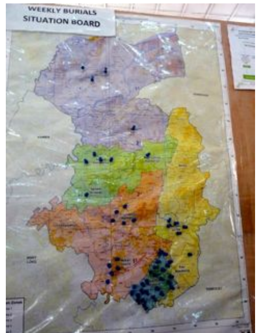
Managing the burials, Bombali District

That's when the government approached three faith-based NGOs -- World Vision, CRS, and CAFOD –and asked us for help. Now, with funding from Britain, a safe and dignified process has been introduced countrywide, for example by allowing the family the opportunity to pray and have someone they know accompany their loved one to the cemetery. Burial team members initially introduce themselves to the family to offer condolences without hazmat suits, and then carefully put them on afterwards, prior to removing the body. Christians are given the option of a simple coffin and Muslims a burial shroud, as their respective traditions require.