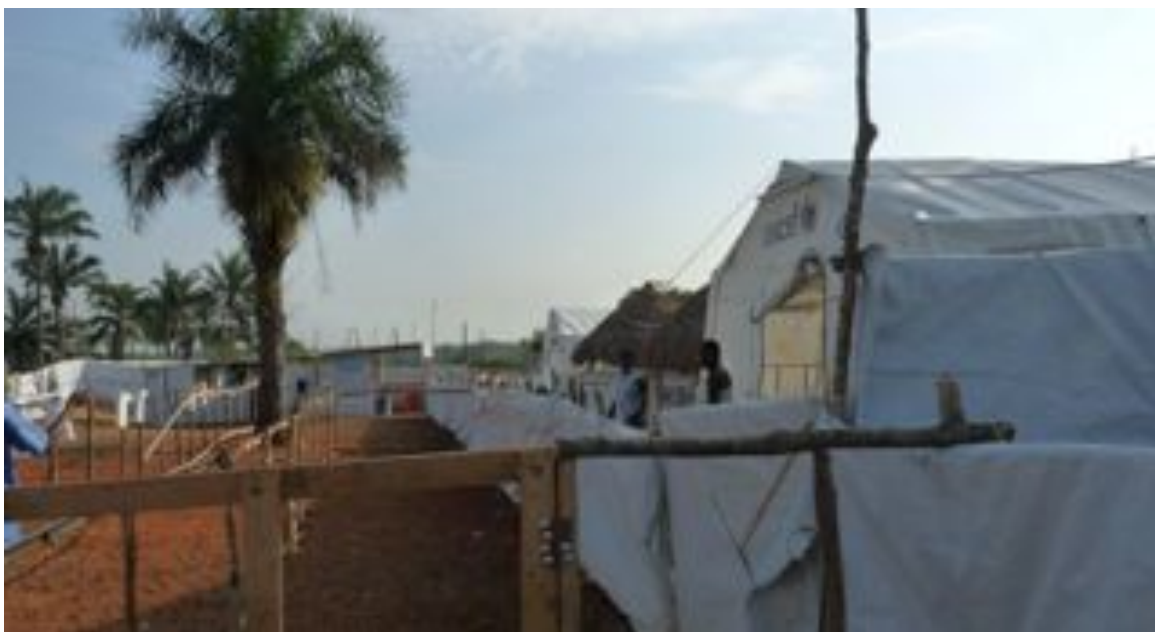
Top: Standing on line to get one's temperature taken, along the roadside. Bottom – Ebola Treatment Center, recently opened. Patients can be seen behind barriers.