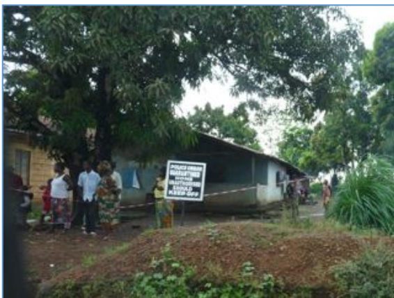
Top: two of the many posters you see just about everywhere. Bottom: Street scene, Freetown. Home under quarantine, with residents just behind the barrier.