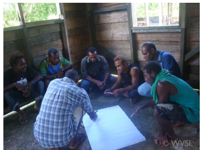
Weather Coast community members working together to stop gender-based violence.

Two Weather Coast area communities included in the study have had surprisingly positive results – including successfully negotiating with narcotic growers and suppliers to either destroy their own plants or stop the circulation of drugs.